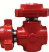
Cushion Elbow MxM