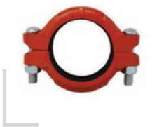
777Z Heavy Duty Flexible Couplings