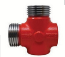
Cushion Elbow FxF