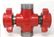
1502 Cross MFMF