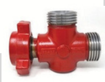
1502 Tee FFM