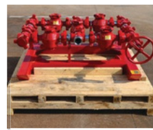
5 Valve Single Adjustable Choke Manifold

2x2 1502 Plug Valves with dual 1502 adjustable chokes. Skid Mounted