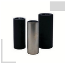
Sucker Rod Couplings

API 11B Grade D AISI 5140 Class T, Spray Metal & Combination Couplings Full Size & Slim Hole Sizes: 5/8", 3/4", 7/8", 1"