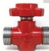
1502 Tee FMF