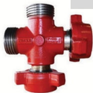
1502 Cross FFMM