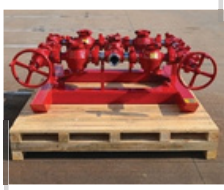
5 Valve Dual Adjustable Choke Manifold

2x2 1502 Plug Valves with dual 1502 adjustable chokes. Skid Mounted