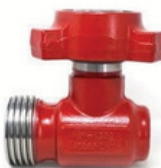
Cushion Elbow FxM