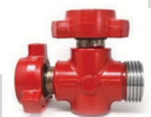
1502 Tee FMM