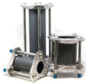
Bolted Sleeve Coupling Diameters: 1" thru 16" Lengths: 5", 7", 12", 16", 24"