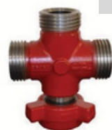
1502 Cross FFFM