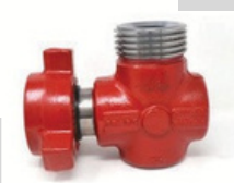
Double Cushion Elbow FxM