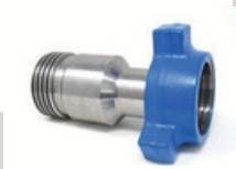
1502 MXF 9.19" Spacer