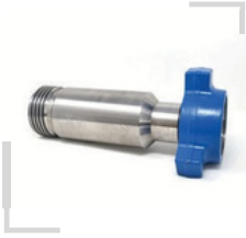
1502 MXF 14" Spacer